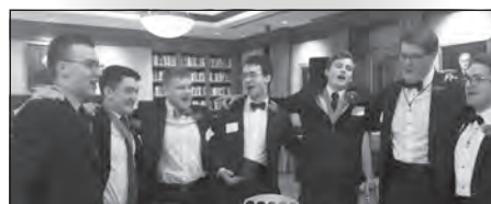
University of Toronto contingent.