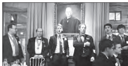
VP alumni and undergraduates enjoying the festivities.

After the dinner's conclusion, both alumni and undergrads extended the festivities by sampling the liquid refreshments offered at a number of nearby establishments, making the trip to New York by many truly an evening to be remembered.