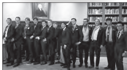
A group of CC actives and alumni with brothers from other chapters, gathered for a picture.