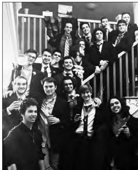
The VOO Chapter.