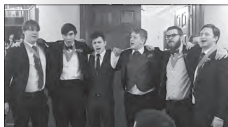
Western Ontario contingent (photo by Doug Stives, VL'68).